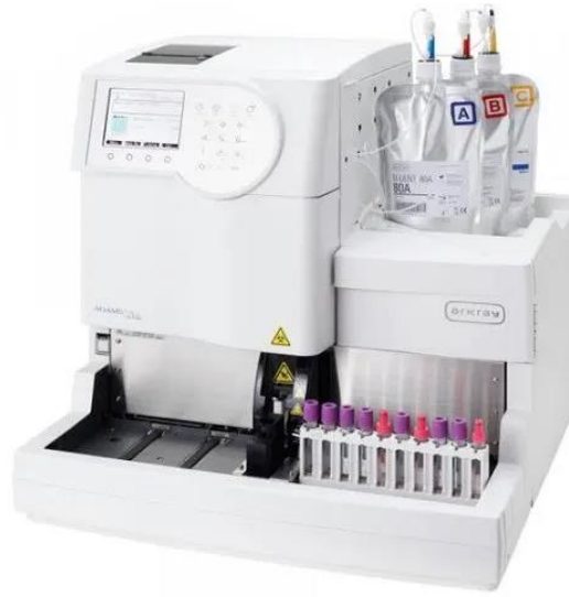
FISH microscope •