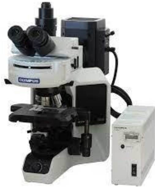
Multihead Teaching microscope • •