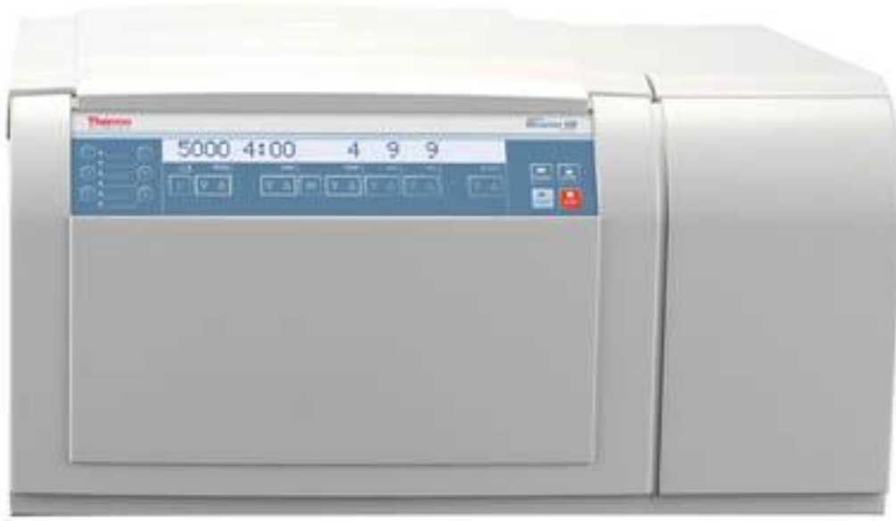
Western blotting system