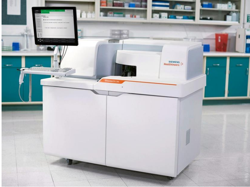
Nephelometry analyzer Atellica NEPH 630 •