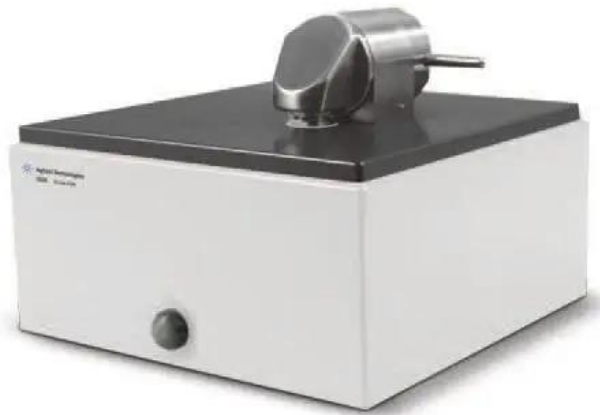
HPLC analyzer • •