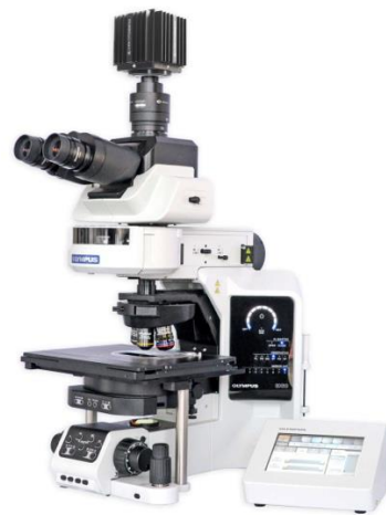
Fluorescent Trinocular microscope •