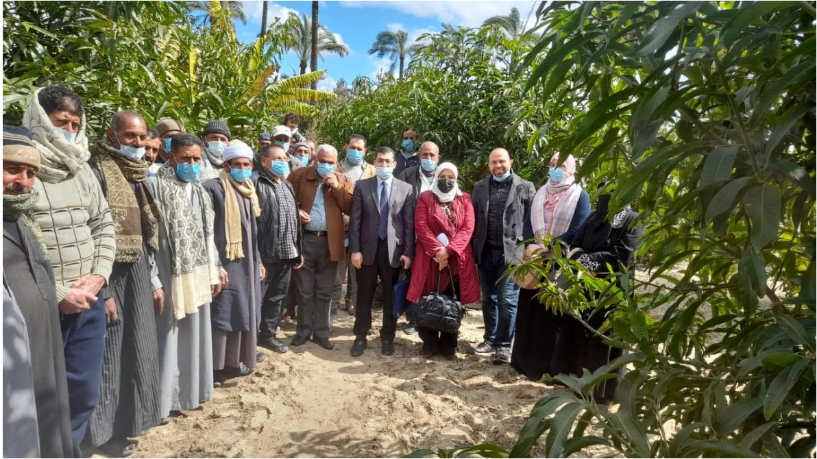
Guidance convoy entitled: Agricultural operations to improve the soil and increase the productivity of field and vegetable crops . https://kfs.edu.eg/agre/photo/7320211015117.jpg