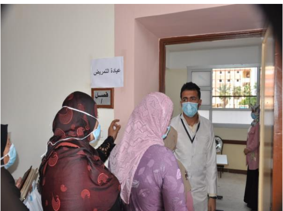
Integrated Medical Convoy to the Villages of Motobas.

https://kfs.edu.eg/engkfs/display.aspx?topic=90720